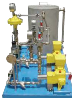
Dosing system skids