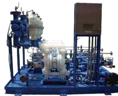
Custom application packages